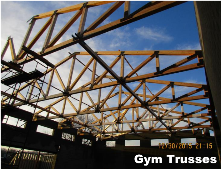
12/30/2015 21:15 Gym Trusses