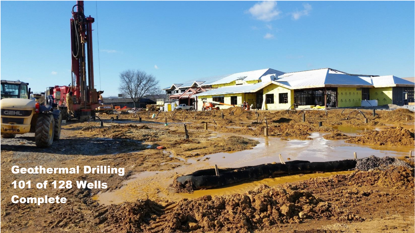
Geothermal Drilling 101 of 128 Wells Complete