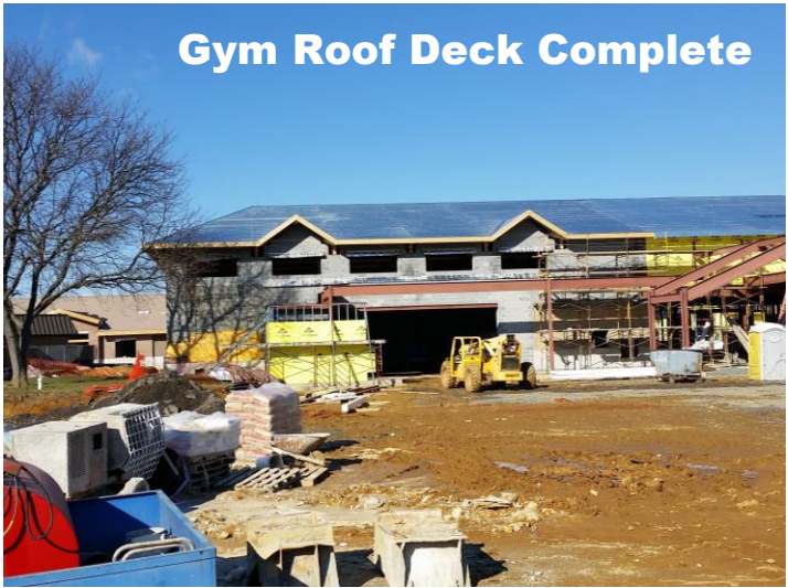
Gym Roof Deck Complete