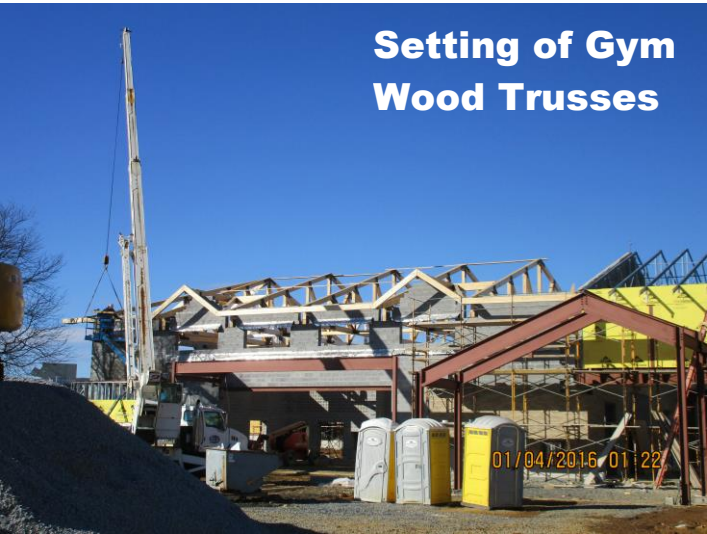
Setting of Gym Wood Trusses