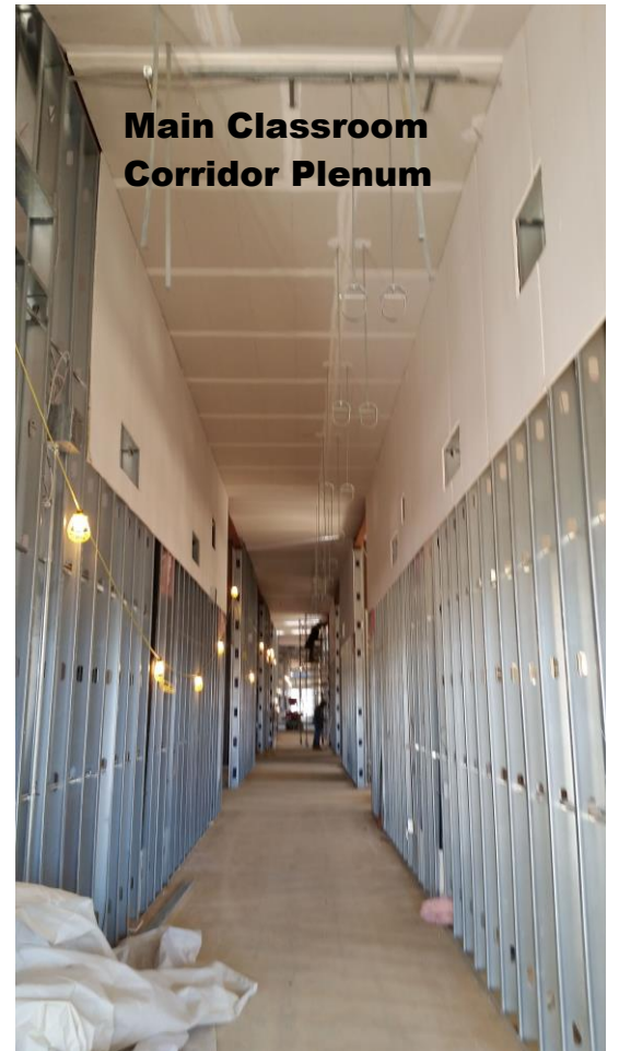
Main Classroom Corridor Plenum