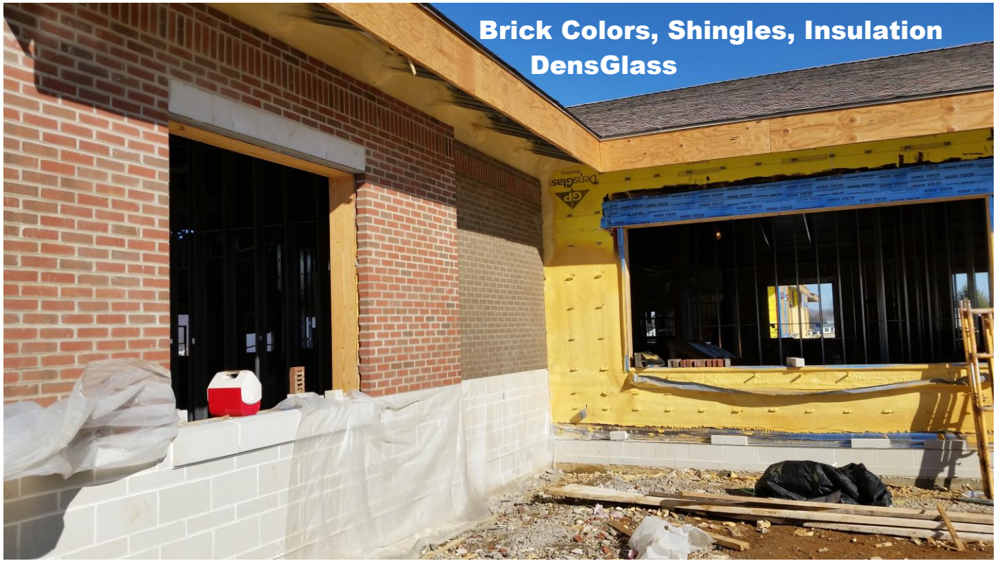
Brick Colors, Shingles, Insulation DensGlass